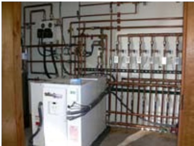
Geo-thermal mechanical room with ground source heat pump connects to six 200 ft. wells drilled beneath the driveway.