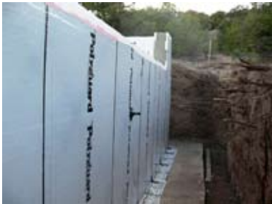
Garage walls, bermed into the slope, are constructed from Insulated Concrete Forms (ICFs) with waterproofing material applied.