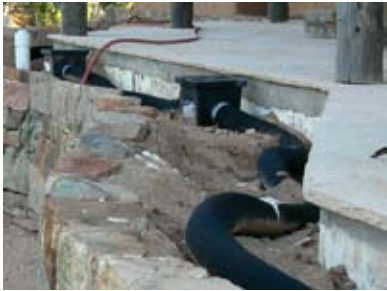
The remaining 20% of the roof water flows into passive irrigation. The excess, during heavy storms, is directed into one of three retention ponds.