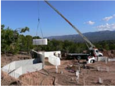
Crane places one of three 1700 gallon cisterns (5100 gallons total) that catch 80% of the roof water.