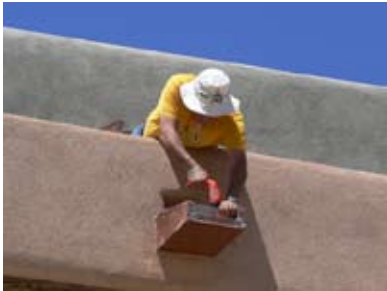
Daming the ends of the canales directs water directly down into catch basins.