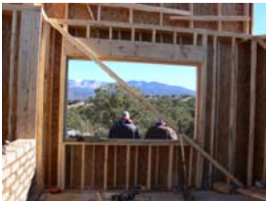
12" thick double framed walls allow for continuous insulation.