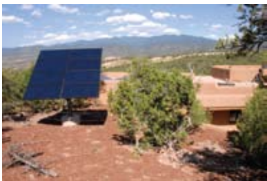
Solar Photovoltaic 1.8 kw tracker.

In obtaining a net-zero designation, and a corresponding Home Energy Rating System (H.E.R.S.) Index of -5 (minus), it isn't simply a matter of adding renewable energy or even energy efficient systems for heating and cooling. It all starts with the building envelope. The Emerald Home attained a H.E.R.S. 35 before adding renewable energy. The calculated heat load for the home, based on building performance modeling, estimated the home to have a 35,000 BTU heat load. A typical size home, based on conventional building practices would require 135,000 BTU heat load.