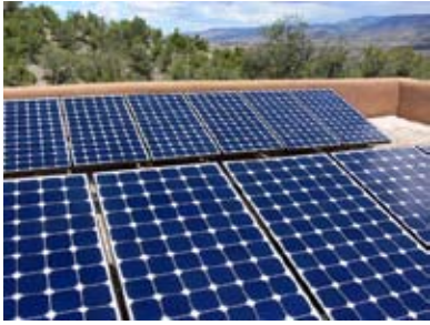
Additional Solar PV roof mounted modules for a total 9.2 kw system. Total output will exceed 20,000 kw hours.