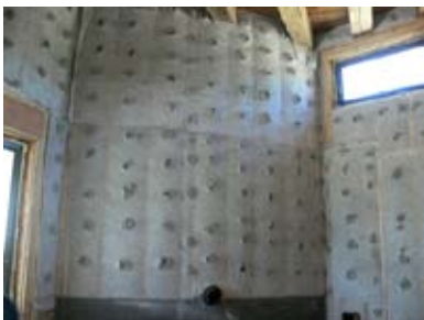
Double framed exterior walls are packed with blown-in cellulose for a true R-42 with no Thermal Bridging.