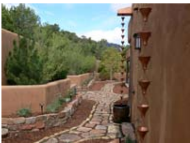
Copper rain chains assure water flows into the catchment system even during windy conditions.