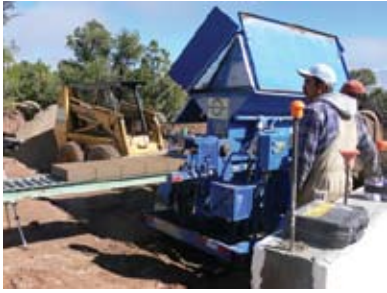
Making Compressed Earth Block on site.