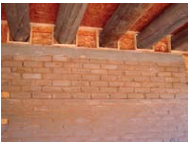
Master bedroom vigas (natural beams) are salvaged from standing dead trees from a local forest.