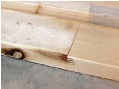
Finger jointed studs from mill cutoffs.