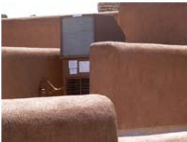
OaSys hybrid Air Conditioning uses dual stage evaporative technology producing 40 SEER of cooling for a mere 580 watts of electricity.