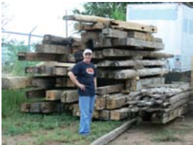
Reclaimed hand hewn beams.